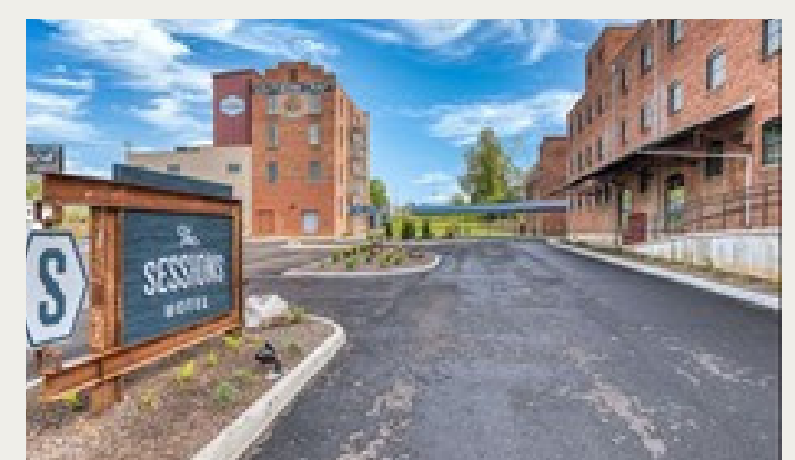
The Sessions Hotel 833 State Street Bristol, VA 24201 (276) 285-5040