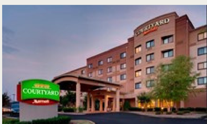
Courtyard by Marriott Bristol 3169 Linden Drive Bristol, VA 24202 (276) 591-4400